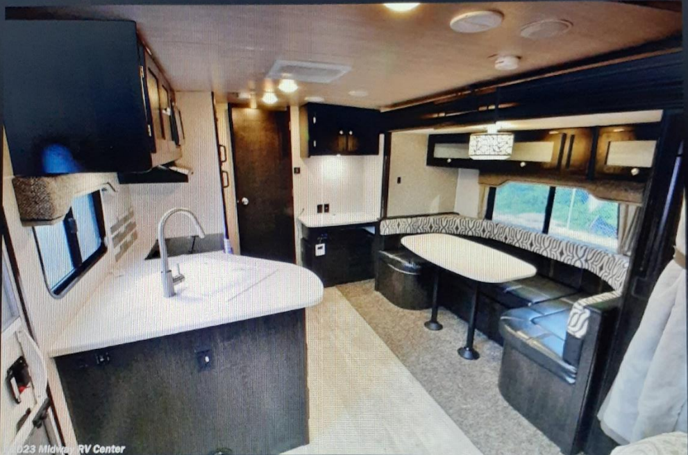
23 Midwest RV Center